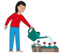
Water the flowers