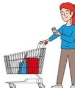
Do the (food) shopping Do the grocery shopping