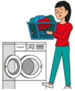
Do the washing Do the laundry /'lɔːndri/