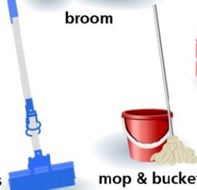
mop & bucket