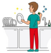
Do the dishes Do the washing-up Wash up