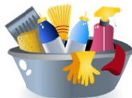
plastic tub with cleaning supplies