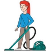
Vacuum /'vækju:m/ Hoover /'hu:və(r)/