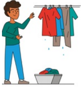
Hang out the washing Put the washing out