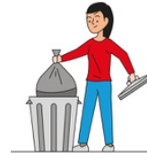
Put the bins out Take the trash out